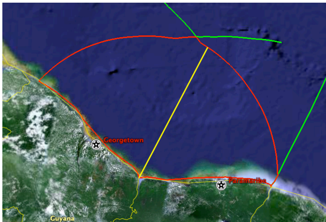
Figure 7. The division of the region in Figure 3 by the 28-degree line. The red curve outlines the entire region. The yellow line is a loxodrome with a bearing of 28 degrees. The green curves are extensions of the 200 nmi boundary and the Suriname – French Guyana equidistance line.